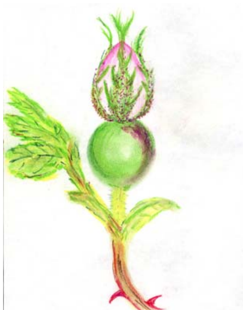
Fig 3. Detail of rose flower bud.

After fully exploring the subjective view of the plant, we turn to the objective observation. It is best if we stick to only factual description, taking it in turns to start with general habitat we find the plant in and its general dimensions before moving to ground level to observe how the plant establishes itself, looking at roots and lower stem/trunk. Only moving on when all minute details of botanical features of each part are described until every detail of stem, leaf, buds, flower and fruits if present have been exhausted.