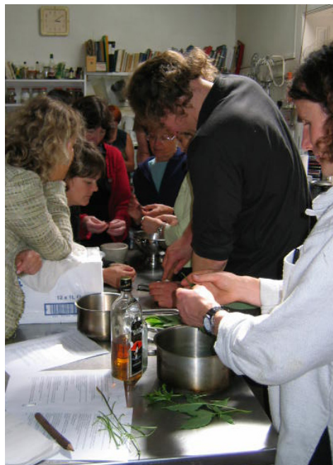
Figure 7. Exploring different media for preparations of plant's healing expression

Stage 7. PRODUCTION OF MEDICINE and is the production of the new medicinal product.