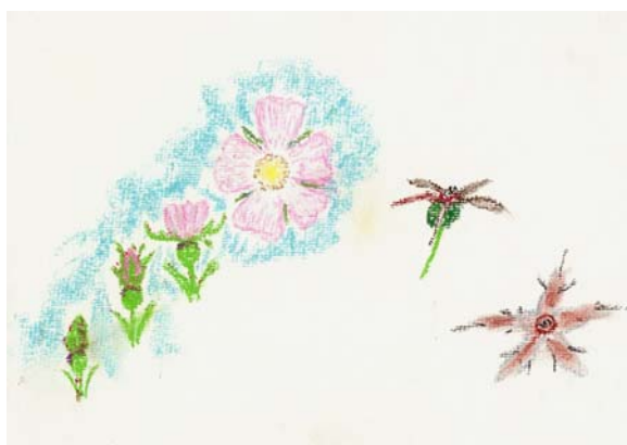
Figs. 4 & 5. Rose growth sequence and meadowsweet pressed leaf sequence.

Stage 2. EXACT SENSORIAL IMAGINATION is analogous with synthesis, the putting together of facts to allow appreciation of the plant or patient as a living growing being. It involves following the growth process of a plant, for example, how it looked this time last year or will look this time next year or identifying a person's core, inherent constitution and how or why the person has deviated from that in the present time.