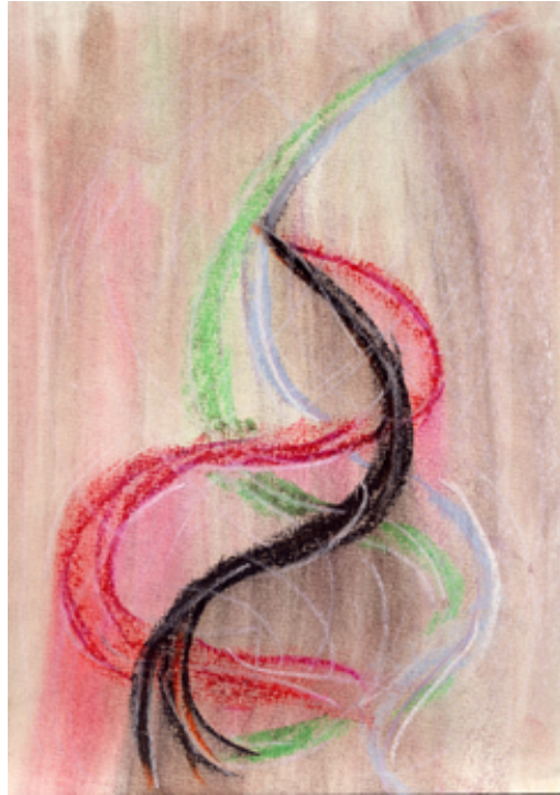
Figure 2. Mood pastel drawing of Hawthorn.

Stage 1. EXACT SENSE PERCEPTION is familiar to conventional science as factual information gathering i.e. of keenly observing the physical attributes of the plant or a person's life story.