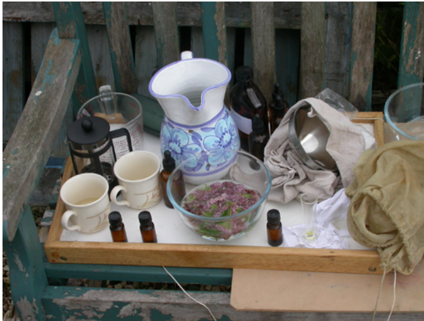
Figure 8. The final preparation of a flower essence of Hemp Agrimony