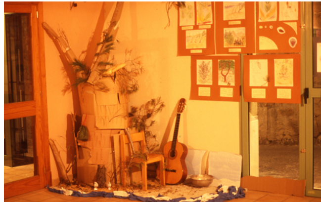
Fig 6. Installation of Pine study collating all aspects explored.

Stage 6. INCARNATING THE IDEA is growing the idea or remedy into matter involving an 'alchemical' distillation of stages 4 & 5.